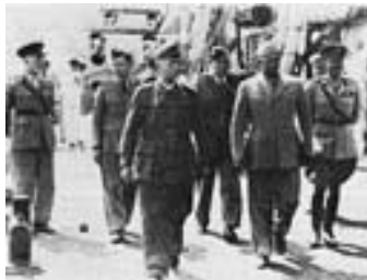
ABOARD H.M.S. NELSON, standing off Malta, 29 September 1943. Officials present at the signing of the long terms surrender document are, from left: Lord Gort, Air Chief Marshal Tedder, Marshal Badoglio, Lt. Gen. Sir Noel Mason-MacFarlane, General Eisenhower, and General Alexander.

It is fully recognized by the Governments on whose behalf I am acting that these terms are in some respect superseded by subsequent events and that several of the clauses have become obsolescent or have already been put into execution. We also recognize that it is not at this time in the power of the Italian Government to carry out certain of the terms. Failure to do so